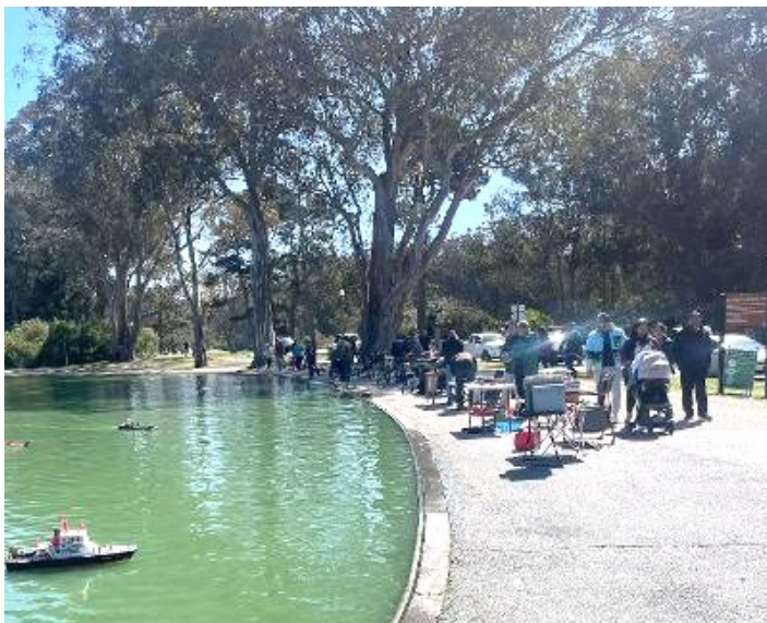
Steam & electric RC