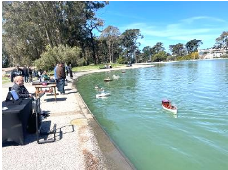
Power boaters relax by the Lake

It was a beautiful day at the lake on Sunday. Nice mix of boats and wonderful spring weather. If you don't normally come to run boats, join us. We run from about 9:30 to 2:30.