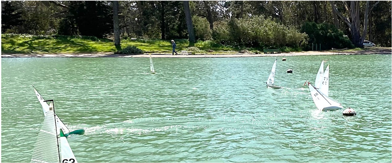
Boats blown over.