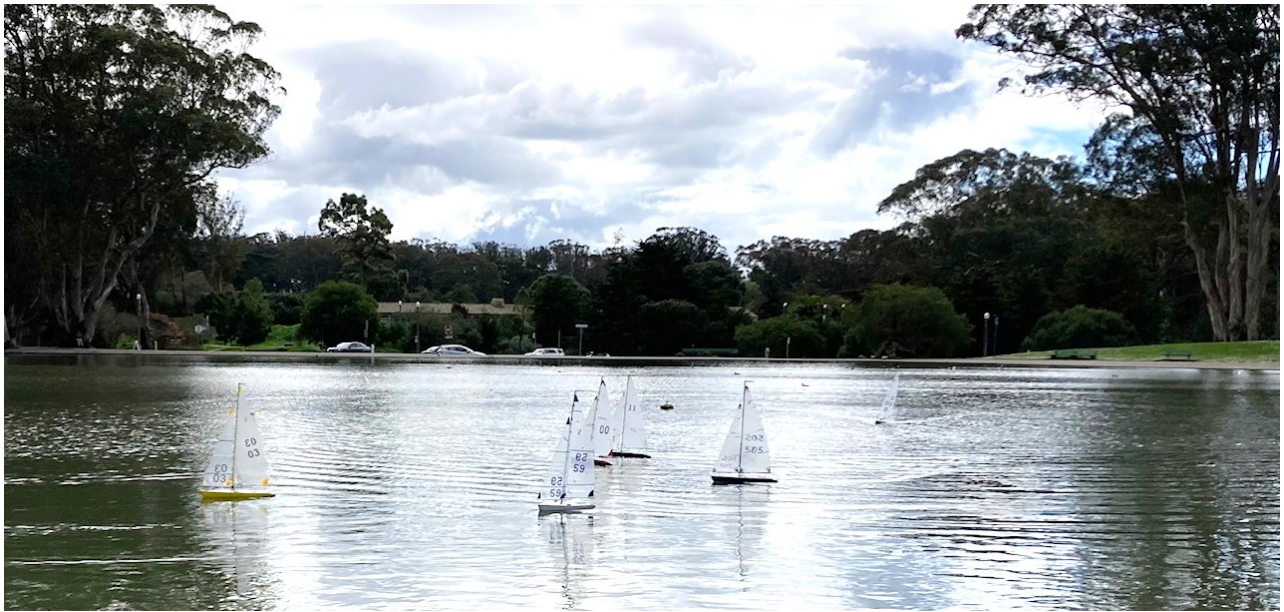
The competition was close ...