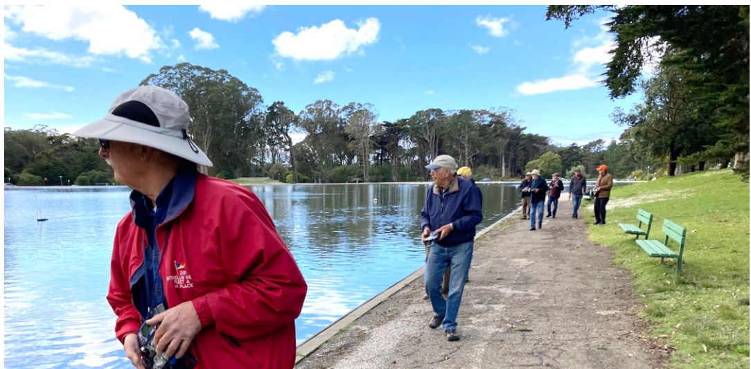
Most skippers were intent on positioning their boats into the wind and pointed the right direction.

And competitive, friendly sailing! But four different skippers placing first--Fine Business! (That's ham radio lingo for high praise.)