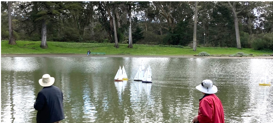
... and closer.