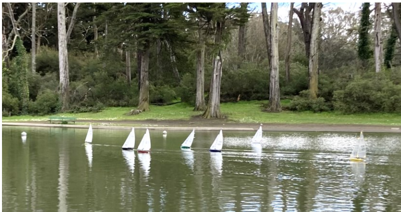
Lovely boats, great day.